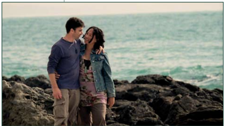
A still from the latest Like Minds, Like Mine television campaign.

For more information about Like Minds, Like Mine, see: www.likeminds.org.nz