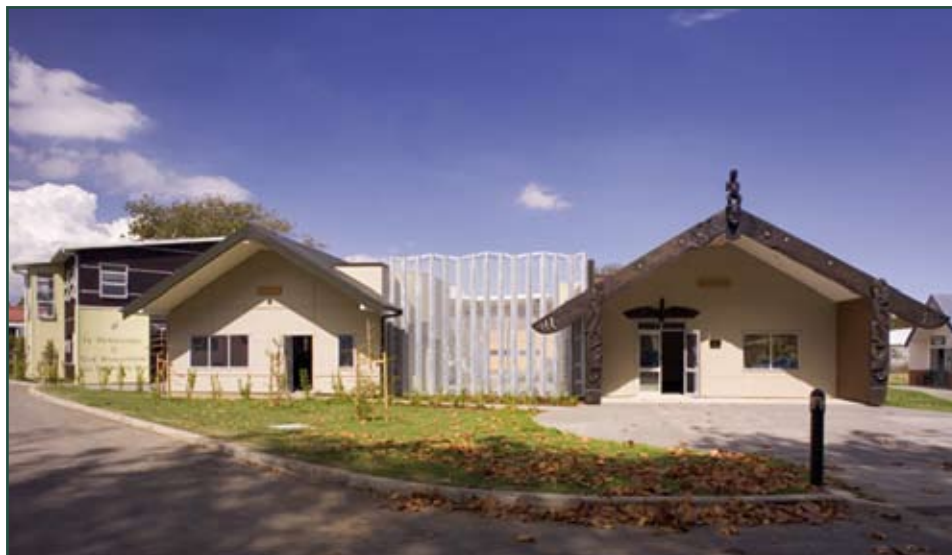
Tane Whakapiripiri – Forensic Māori Mental Health Unit.

Key concepts identified to be beneficial for healing were the central courtyard village layout, marae frontage, visual language of carvings, acknowledgement and use of natural elements, and referencing the New Zealand native forest.